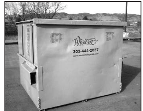
Convenient size and accessibility!

Western can provide a separate 6-yard container for each individual recyclable material or one for all three materials to be combined—mix your wood, cardboard and scrap metal together. Construction recycling is available in 6-yard containers only. Construction trash service is available in 2- or 6-yard dumpsters and in 12-, 20-, 30- and 40-yard roll-off containers.