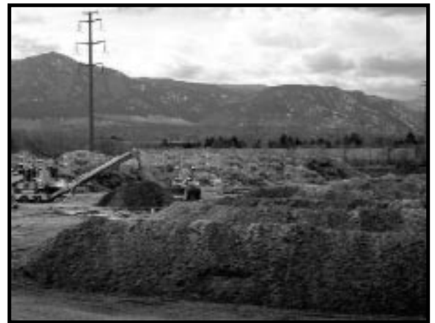
WESTERN'S COMPOST FACILITY