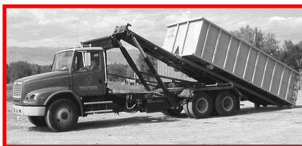
Western Disposal's Roll-off

If you live within a homeowners association and are tired of looking at your neighbor's junk (or maybe your own), now is the time to plan a neighborhood cleanup. It's easy — just pick a weekend, call for one of our 30-cubic yard construction roll-offs (22 feet long, 8 feet wide, 6 feet tall), place it in a central location, and go to work. Residents can discard broken furniture, yard debris, etc.— all that trash which degrades the aesthetics of your neighborhood. For pricing and availability, call our Sales Department at (303) 444-2037.